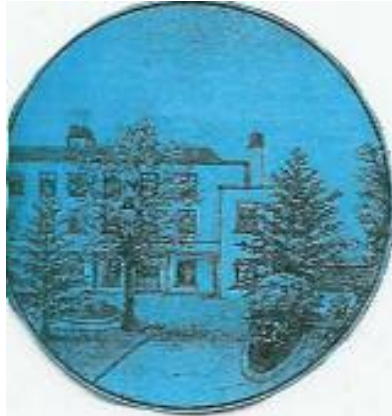
The First St. Aubyn's (1884-1893)