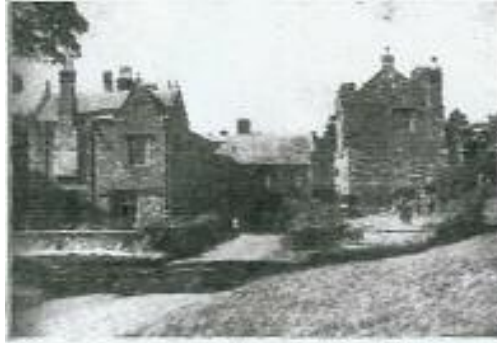
Whitehall, Cumberland: The fourth but temporary St. Aubyn's (1939-1946)