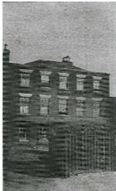
The Second St. Aubyn's (1893-1918)