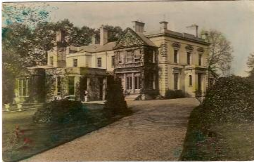
The Present St. Aubyn's (1918 to date)