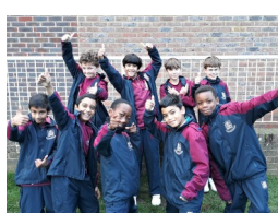
Year 5 Boys winning team - Hayton

involved with a number of boundaries and wickets taken in each match. Well done to all involved for their passion and performances and congratulations to the winning houses.