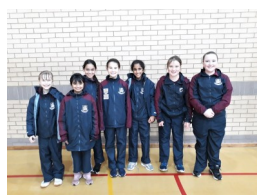
Year 6 Girls winning team - Grove

This week, as a culmination to the work seen in PE lessons, pupils from Years 4 to 8 took part in their House Cricket competition. Each house took turns bowling and batting over ten overs and needed to score the highest number of runs to qualify for the final play-off match. There were fantastic performances from all the pupils