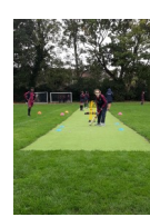
Years 7 and 8 House Cricket

involved with a number of boundaries and wickets taken in each match. Well done to all involved for their passion and performances and congratulations to the winning houses.