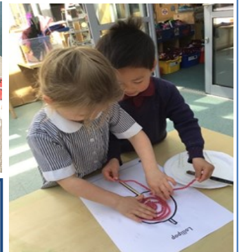
'L' for Lollipop!