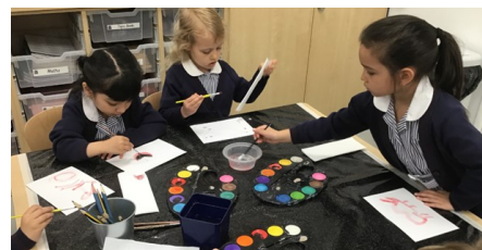
Painting our favourite minibeast.