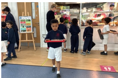
Carrying our own trays at lunchtime.

This term is all about preparing the children for Year 1. At lunchtimes, they have been collecting their own food and carrying it on trays to their table. It has been lovely to see how they are enjoying opportunities to be more independent. This week, we read 'Mad About Minibeasts.' The children drew their favourite minibeast from the story, labelled it and wrote facts about it using connectives. In Literacy, we have been looking at non-fiction and fiction texts that feature minibeasts. In maths, we have been exploring how capacity relates to real life situations, for example, how many people can fit on a bus? In Expressive Arts and Design, the children listened to nature sounds and moved like different minibeasts, such as, flying like a bee and wiggling like a worm.