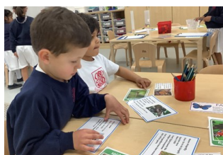
Reading facts about minibeasts.