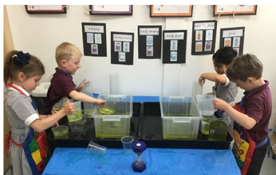
Having fun exploring capacity!