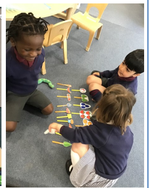
The Ducklings and the Goslings work on retelling the story and ordering the days of the week.